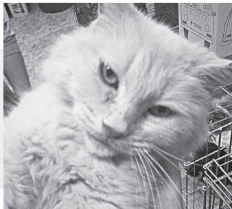
Jeannie, a 5-year-old orange Persian mix. Great personality! She hasn't let the last 6 months in a cage get her down. Squishy, cuddly face. Don't let her picture fool you, she's actually purring!