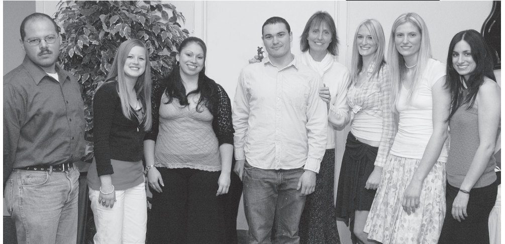
The FLA volunteers began their mobile adoption unit 16 years ago and today have found homes for over 400 dogs and cats. In November 2004 they received non-profit status.