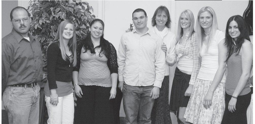
The FLA volunteers began their mobile adoption unit five years ago and today have found homes for over 400 dogs and cats. In November 2004 they received non-profit status.

The Road to Renovation Dinner and Silent Auction was a success raising $4,500! Held at Cal Poly Pomona's Kellogg West Conference Center in February, over 85 guests enjoyed live music, presentations and exciting auction items. Thank you to vendors, guests and sponsors for helping us launch our organization. Your generous contributions are already being put to work.