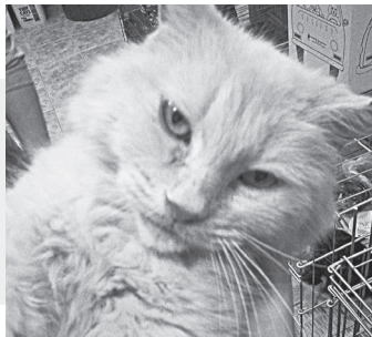
Jeannie, a 5-year-old orange Persian mix. Great personality! She hasn't let the last 6 months in a cage get her down. Squishy, cuddly face. Don't let her picture fool you, she's actually purring!