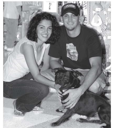
Blackout meets his new family 20 months after his rescue, June 24, 2006.

Blackout's story is unique, but unfortunately a reality for many shelter dogs. He came to the shelter under a police hold with his Shepherd friend, Lady, in October 2004. Police were investigating Blackout's owner for abuse and neglect that